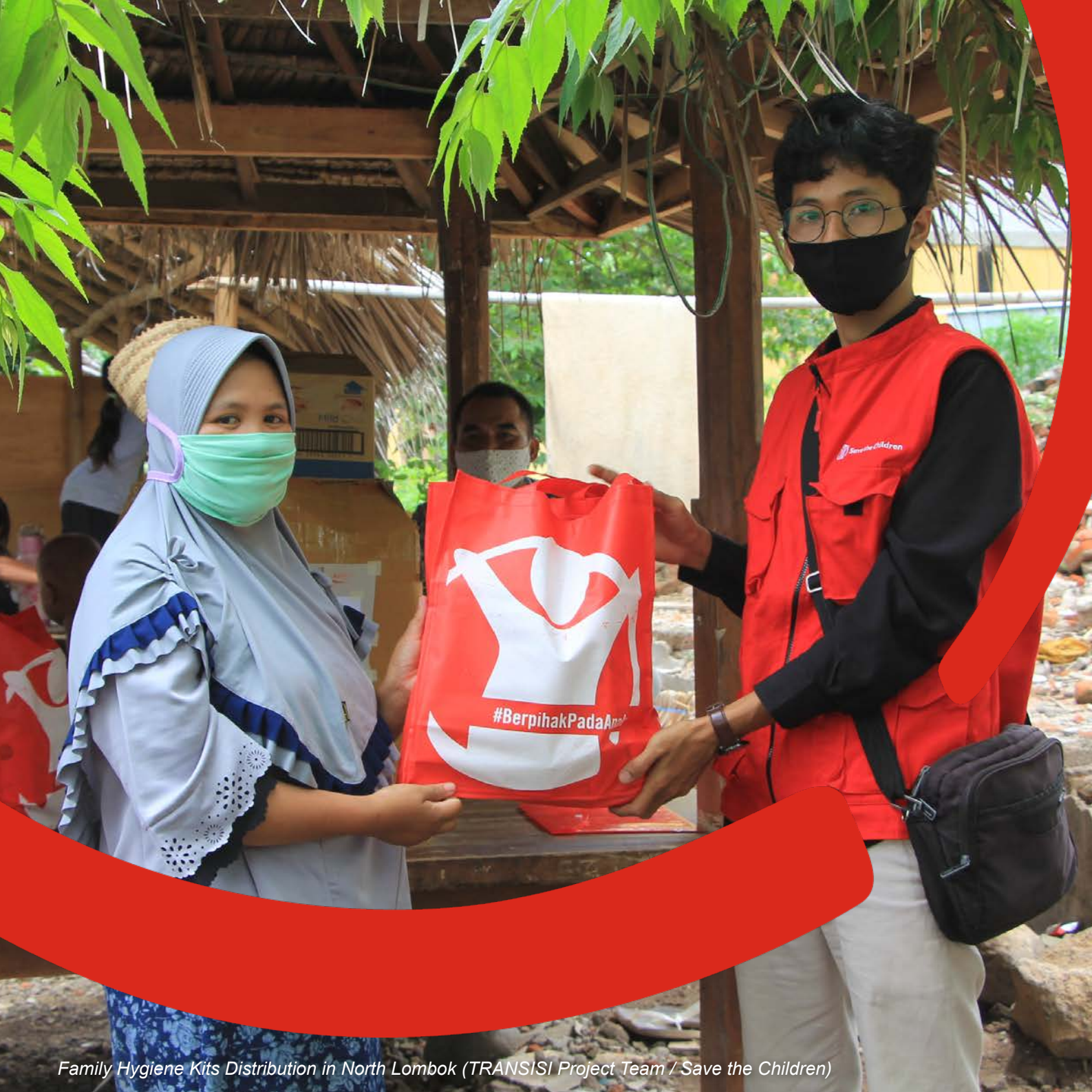
Family Hygiene Kits Distribution in North Lombok